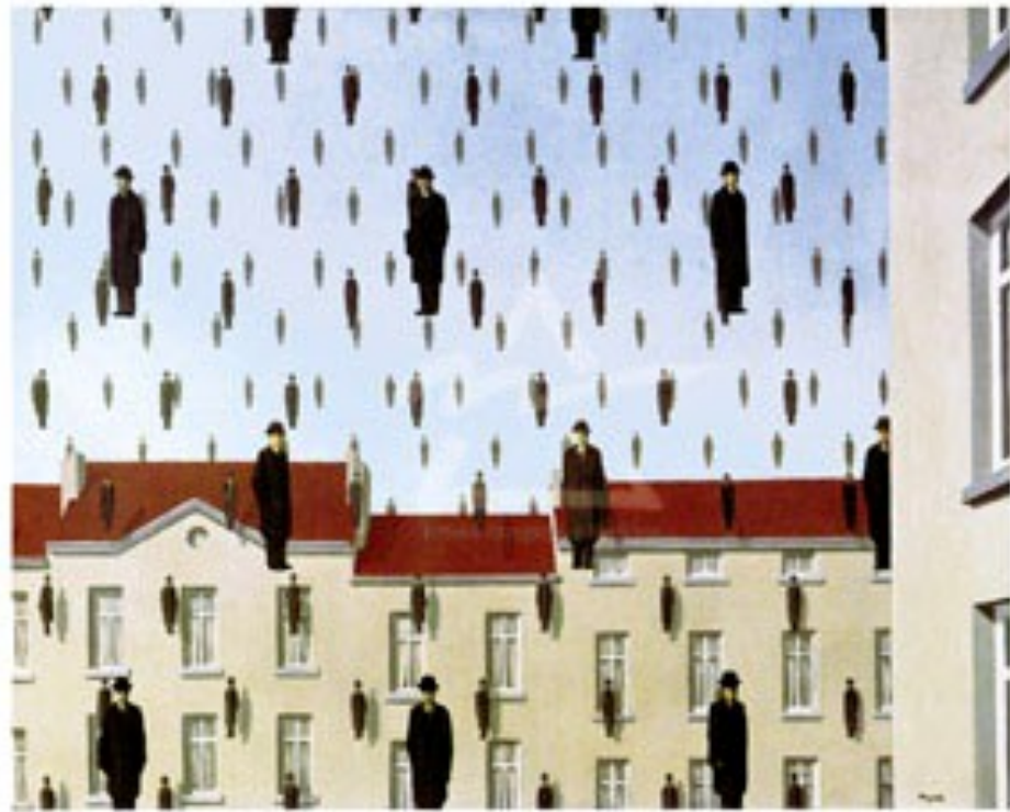
“La Golconde” 1953.